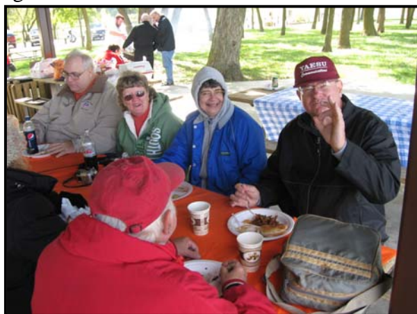
SWIARC Picnic 2010 WBOGXD & NOGR with XYLS

Prior to the flood last year there were shelters, charcoal grills, and a place you could stand within inches of the fast flowing river. Let's go see if anything's changed. A tailgate swapmeet is part of it. Bring stuff.