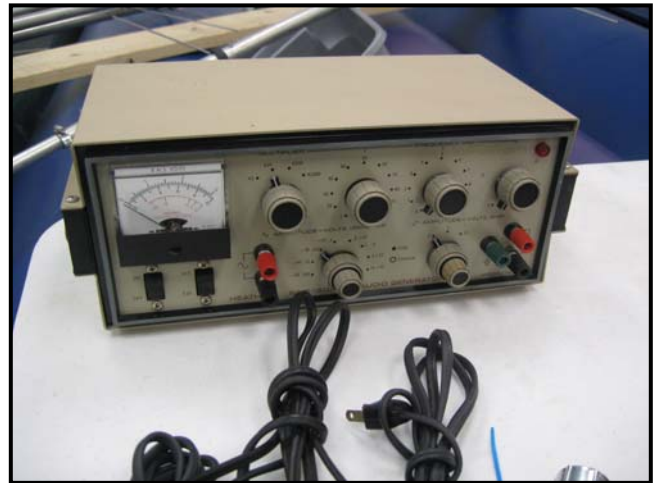
Heath Audio Gen

This fest had one of everything including a Heathkit Keyer with incorporated paddles and a newer light-brown Heath audio signal generator that sold early. (I took a picture, turned around, and it wasn't there when I looked back.)