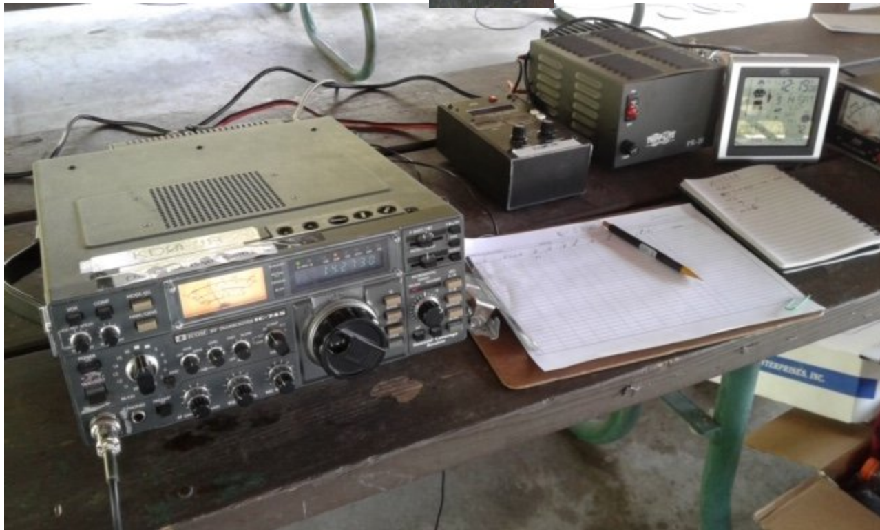
Illustration 5: A typical HF =Band Station setup

Bill Snyder's Icom IC 745 set up at Lake Manawa Park KD0FJR /0 iowa