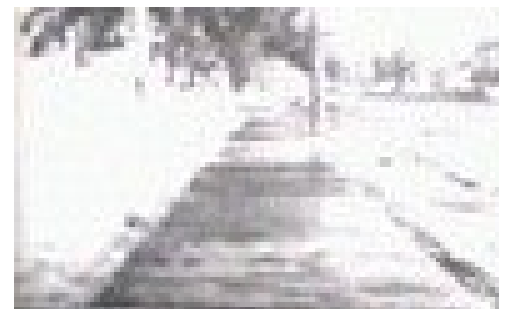
Illustration 2: 1978 icestorm SE Nebraska

common here in the Midwestern United States BUT Many Tornadoes like in 1975 along with Blizzards, Ice-storms, Floods happen here. The Major flooding in 2019 recently effected both the Platte and Missouri River basins with considerable disruption of traffic routes, cell and land based telephones, businesses closed. Water plants damaged, with people's life totally disrupted