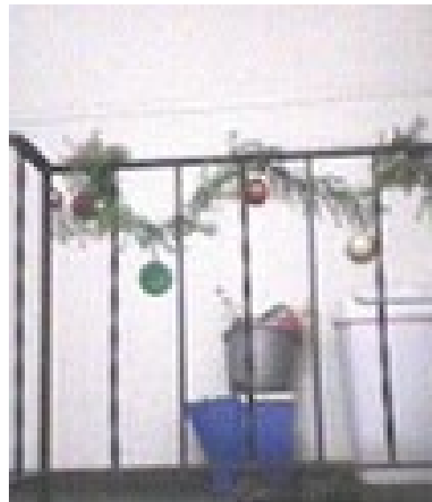
Illustration 1: New HAM Stuff from Santa???

2020 proved a challenge to every trade and person, The very real threat of COVID 19 a serious illness that cannot be taken lightly. Amateur Radio is social Distancing in a best tradition. Voice, Data, CW and fast or slow imagining Aka Television are all way we reach out, find new friends, Talk with our long time pals. Do nets to improve our traffic skills, with the goals of public service.