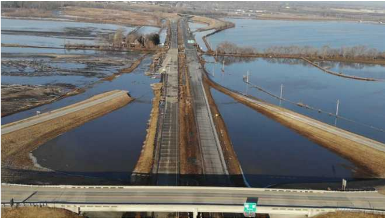
Illustration 3: WEST DODGE ROAD LOOKING WEST TOWARDS VALLEY AND FREMONT

flooded out. Every road, highway going to Fremont was flooded = closed for many days. Enough can not be said of the Ham radio operators heroic assistance in time of need. Pioneer ARC in Fremont gets special praise and thanks.