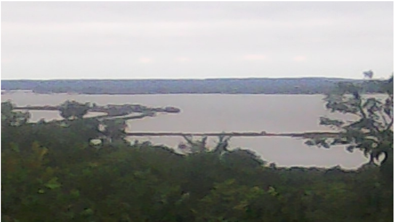
Illustration 4: MISSOURI RIVER

2019 FLOOD WATERS AT PERU NE BLUFF LOOKING TOWARDS HAMBURG, IOWA